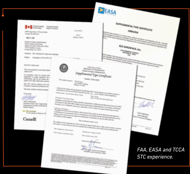
FAA, EASA and TCCA STC experience.